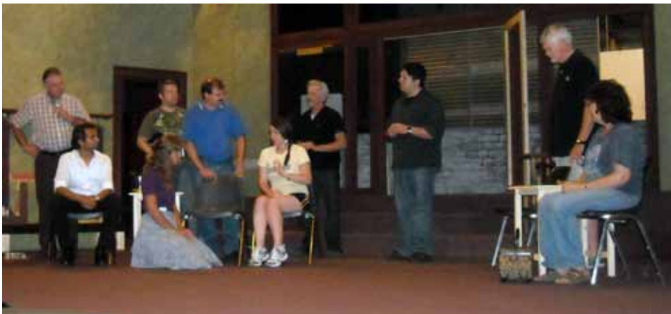
The guests and staff of "Soldier Island" discuss the gramophone they have just heard that accused each of them of being responsible for various deaths.

This season's Blithe Spirit will join And Then There Were None on the ever-growing list of shows that have been produced at Players three times. Can you name the other eight? See page 4 for the answer.