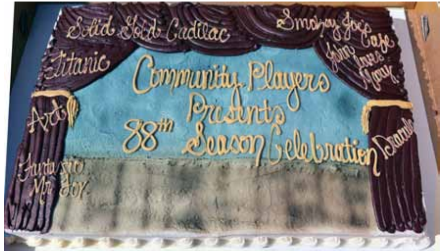
Above: The Reunion Cake (it was delicious).

Come out and join Community Players Theater during the 89th Season, make some memories to last a lifetime, friendships that are priceless, a theater tradition that is timeless and just see how we celebrate a year from now!