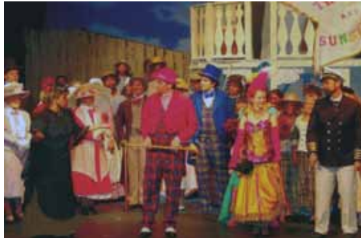
The cast of Show Boat from the 2002-2003 season.