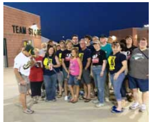
Community Players members sing "Take me out to the Ballgame" at the August 18 CornBelters' game.

To cap off an excellent evening of camaraderie, good food, singing, and baseball, the CornBelters beat the Rockford Aviators 13-3.