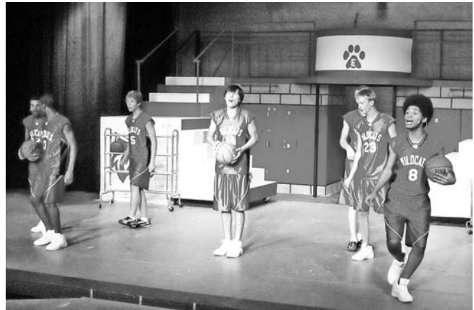
The basketball team runs through drills and harmonizes as they encourage each other to "Get'cha Head in the Game."